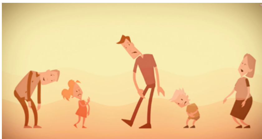
Figure 4.13 Screenshots from animated CcTalk!-videos to convey basic information on the heat and health topic in an entertaining, emotionalizing and thereby motivating manner.

Improving public health decision making in a new climate