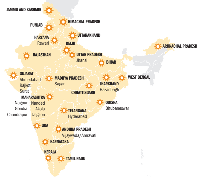
Highlighted states and cities have developed and implemented Heat Action Plans

IMD and NDMA lead national-level efforts to prepare and respond to heatwaves. NDMA is also the agency overseeing India's COVID-19 response and it has issued specific advisories for managing heatwaves during COVID-19 to ministries and department, states, districts, and municipal corporations.