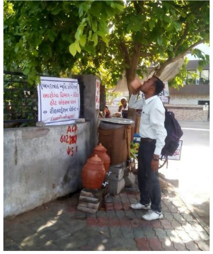
Picture: A drinking water station in Ahmedabad, part of local efforts to respond to extreme heat through the city's Heat Action Plan

Telangana's 2021 heat plan also includes the construction of green building and Energy Conservation Building Codes (ECBC) related to heatwave risk mitigation. The Revenue (Disaster Management) Department Government of Telangana initiated heatwave preparedness programs for 2021 with key departments in coordination with Telangana State Development Planning Society (TSDPS) and UNICEF's Hyderabad field office.<sup>61</sup> The plan acknowledges the ongoing threat of COVID-19 and that the risks of hot weather are amplified for those already most vulnerable to the negative effects of extreme heat.