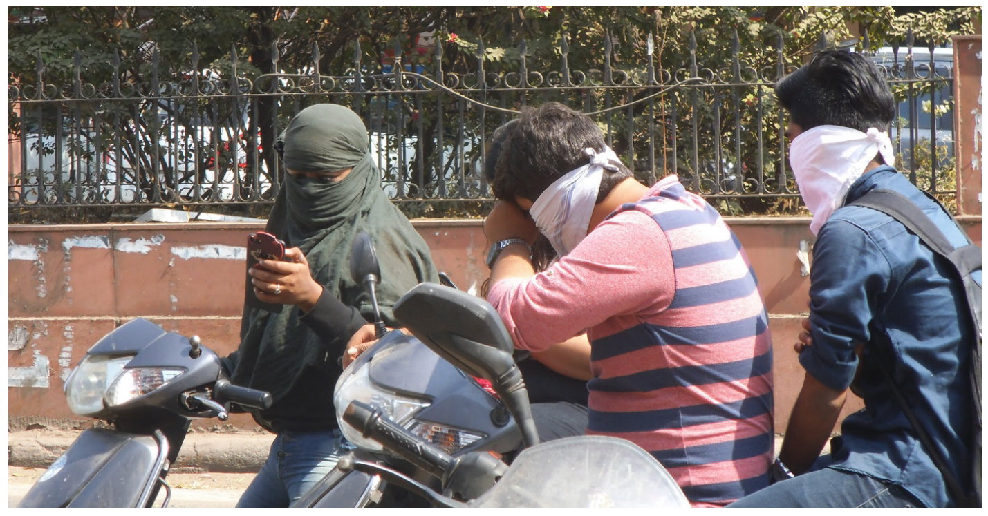
Picture: School and college students are especially vulnerable to extreme heat

To continue to reduce heat-related illness, long term state plans include adopting cool roof technology and carbon neutrality for all buildings. Additionally, the state, under the guidance of the Gujarat Ecological Education and Research Foundation, set up an initiative to enhance the adaptive capacity of natural resource-dependent communities of agricultural, coastal fishing, and pastoral sectors in the Kachchh region.<sup>54</sup>