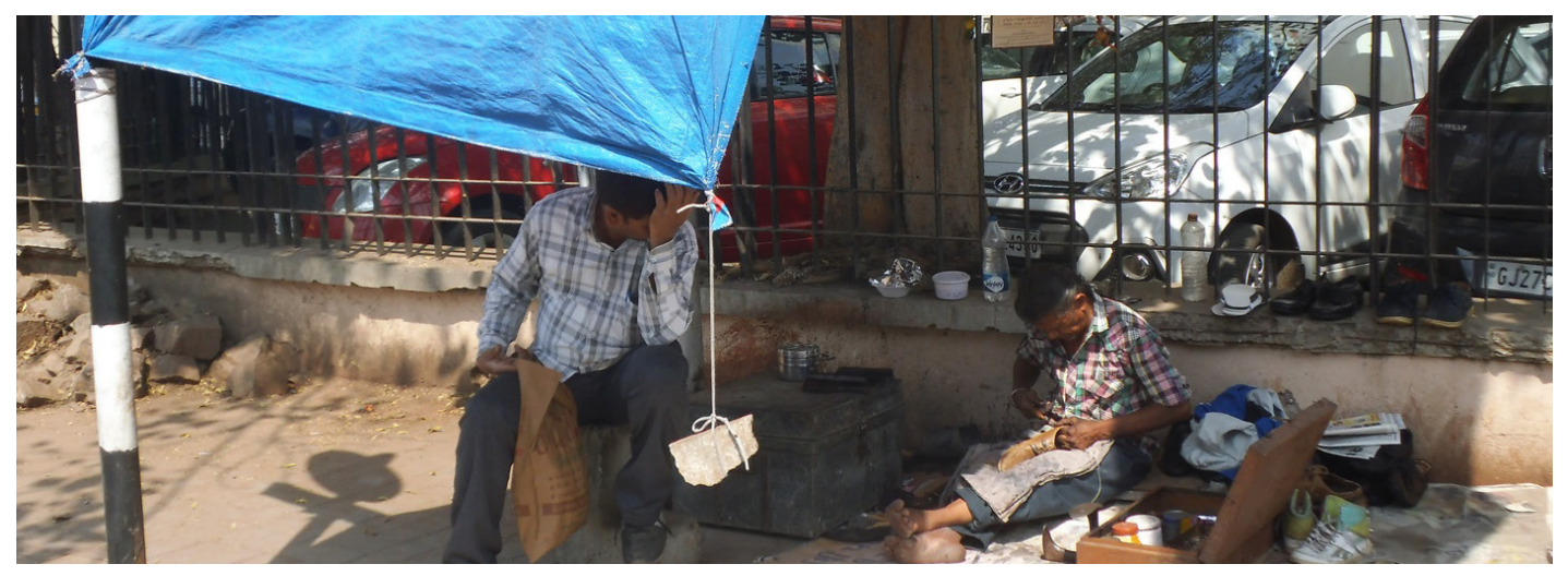
Picture: A cobbler in Ahmedabad, Gujarat works under a makeshift shelter. "

development plans including long-term heat mitigation measures; to specify short, medium, and long-term heat mitigation measures most suited for different regions; and to provide an opportunity for community capacity building and awareness generation. An IMD senior scientist discussed effective early warning dissemination and communication strategies on heat. The current challenge is to convey warnings, forecasts, and other information effectively to intermediaries and end users.