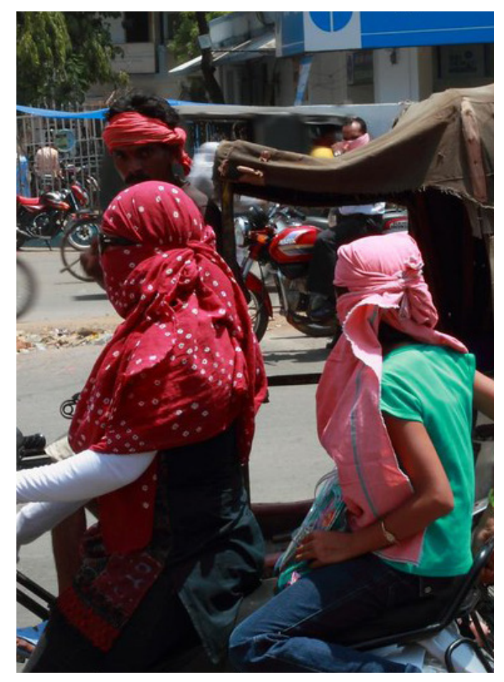
Picture: Women cover themselves to protect against exposure to extreme heat

To prepare for the summer heat season, NDMA held a national virtual workshop on "Early Planning for Heat Wave Risk Reduction" in January 2021, several months before the heat season.<sup>14</sup> This annual workshop brought together academicians, policy makers, national-level ministries, non-governmental organizations, intergovernmental organizations, state governments, and other stakeholders to discuss policies to address heat-related issues. The workshop achieved several objectives: to help vulnerable states and districts in preparation of their Heat Action Plans for 2021; to discuss the integration of various sustainable