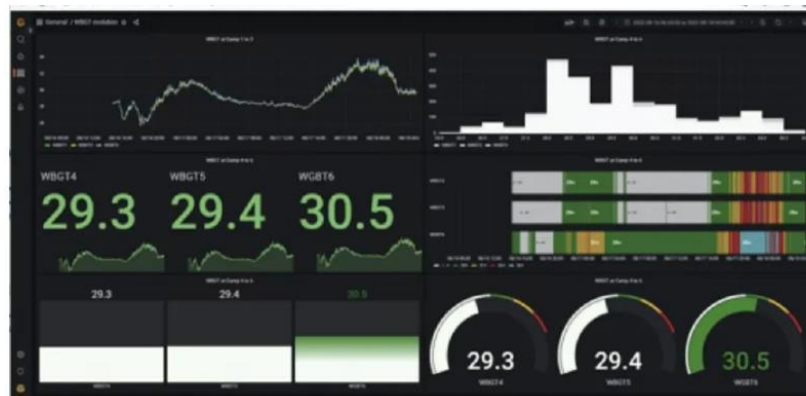
Figure 4: Real-time WBGT monitoring dashboard with alert system