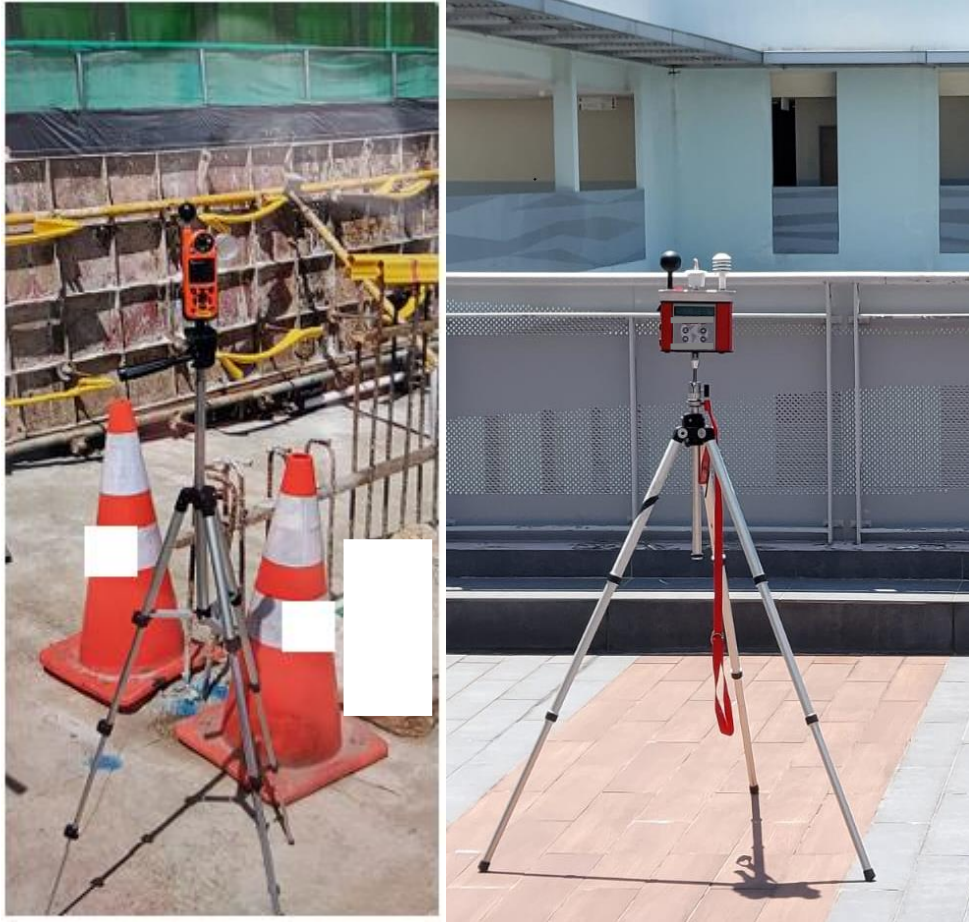
Figure 1 & 2: Examples of WBGT meter setup

5.5 Radiant heat from ground surfaces such as concrete, or asphalt will affect WBGT readings. Measurements should be taken at locations where ground surfaces are similar to areas where work is carried out.